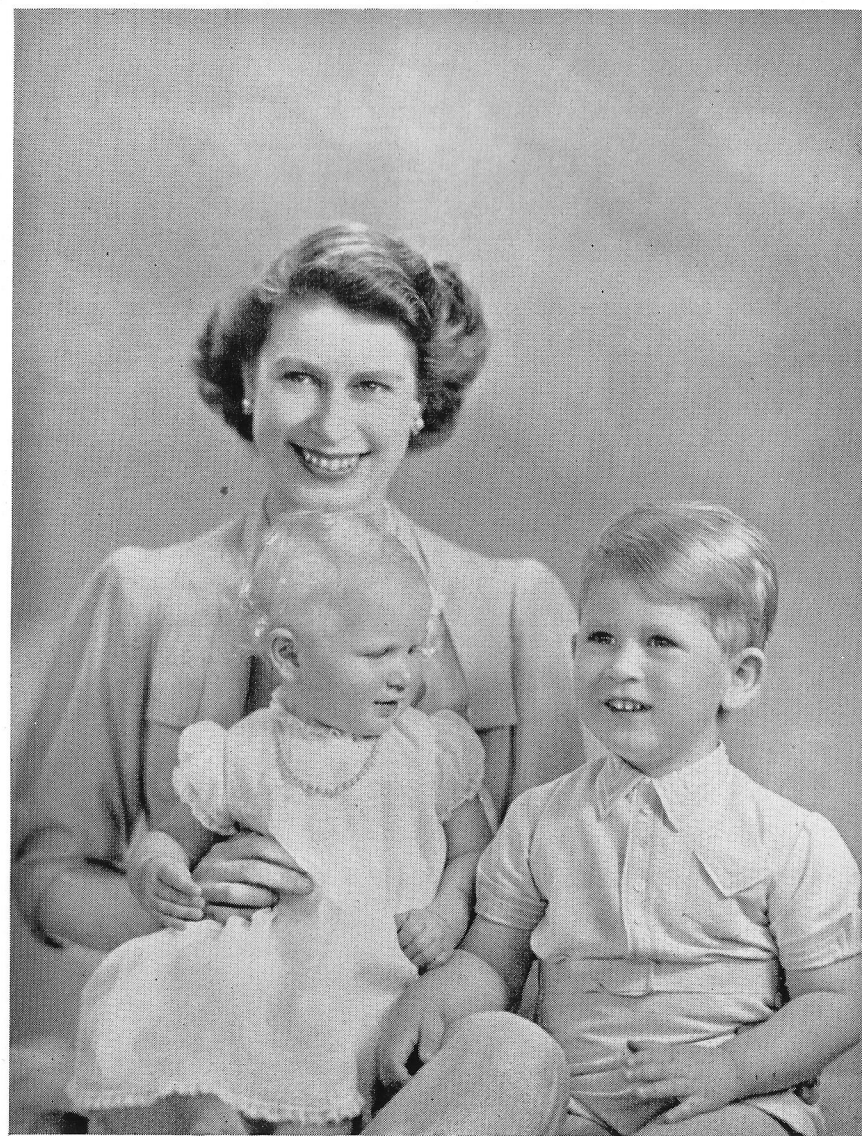
"OUR QUEEN AND HER CHILDREN"