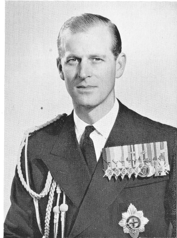
H.R.H. THE DUKE OF EDINBURGH